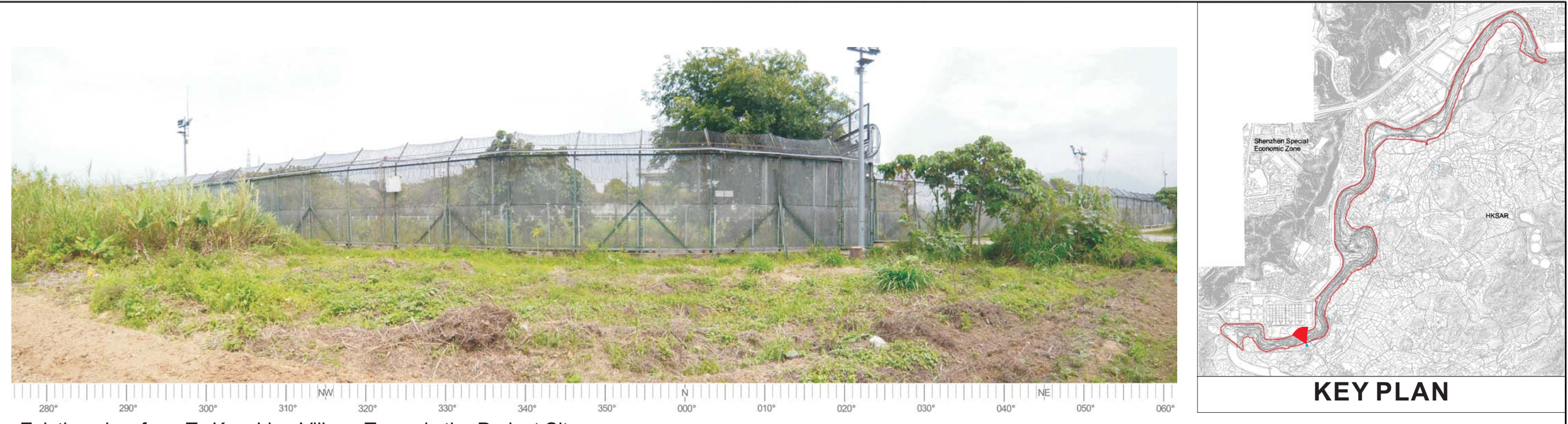
Existing view from Ta Kwu Ling Village Towards the Project Site